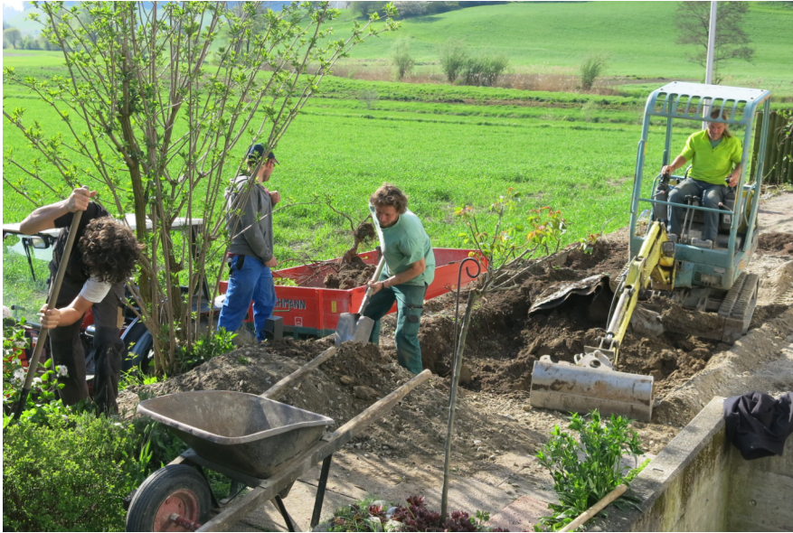
The garden workshop building a biotope for a customer.